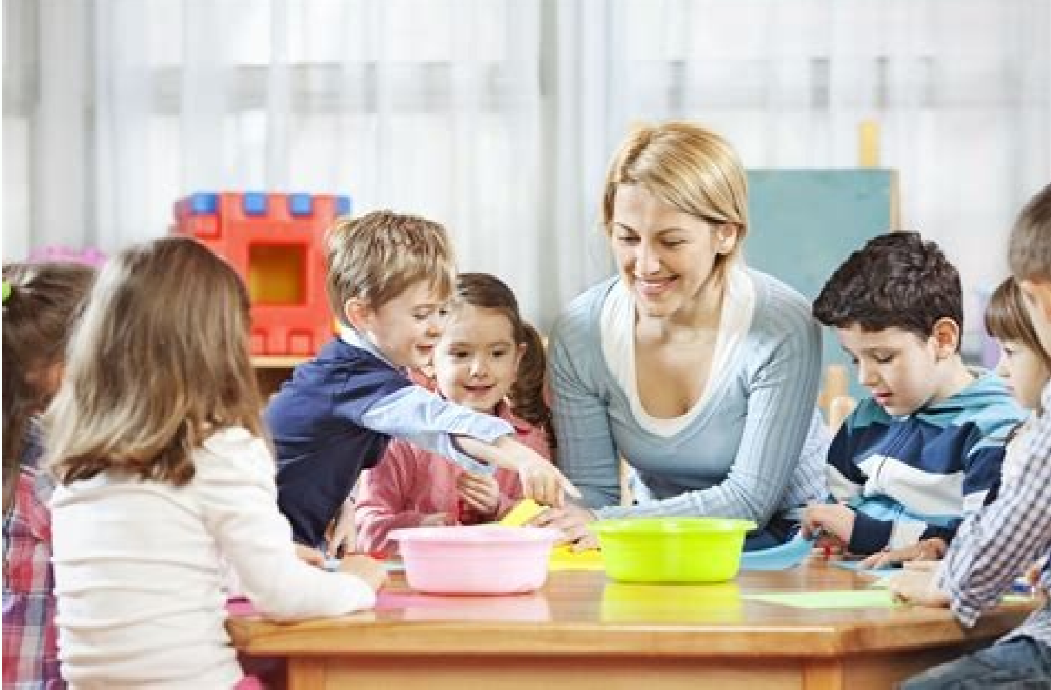
Kindergarten teacher interview questions and answers for freshers.